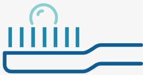
2 years and older = Pea sized

Each family member needs to have their own toothbrush.